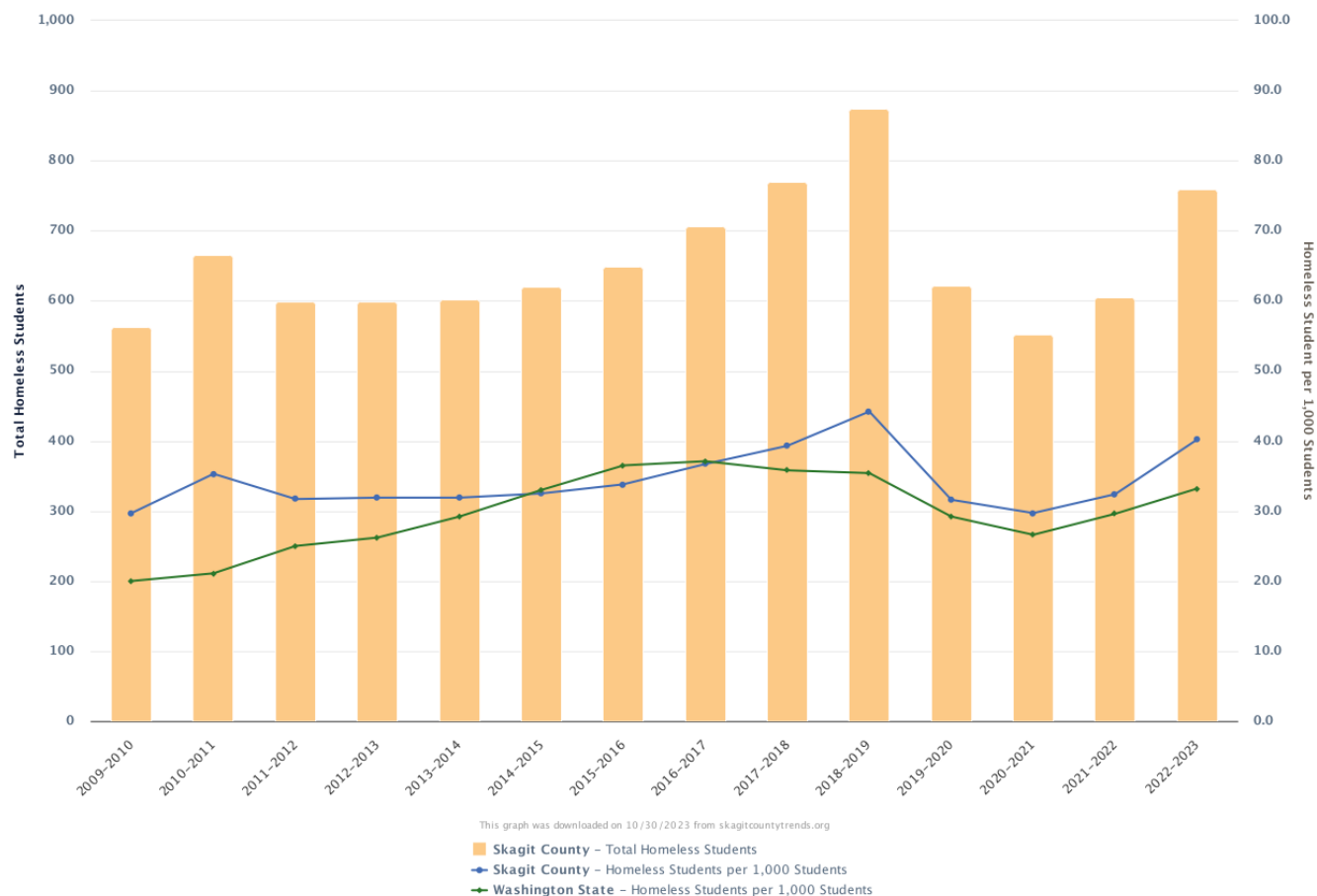
6.4.1 Homeless Students, By Type & Per 1,000 Students Enrolled in Public Schools as Defined by McKinney-Vento